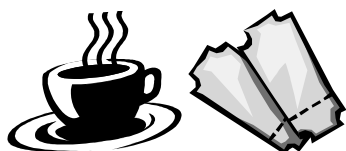
Our new coffee and raffle system – take note!

the first takes you into the upstairs foyer. Here there will be one steward, who will welcome you, and direct you to either the sweet stall, where you can buy sweets and coffee tokens, or into the auditorium and/or bar to buy your raffle tickets and programmes. If you go through the second door, up the two steps to your right, you will enter the bar straightaway.