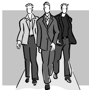
Who’s who on the Club Theatre catwalk?!

who reckons they wanted to do the administration: membership renewals, letters, filing, even the blessed newsletter. The best way of making this person happy is to send in some articles for the newsletter! (was that a big enough hint?). Any paperwork issues, call here!