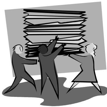
More hands make light work – so join us!

of our regular workers are also in full time employment, have family commitments. The majority of them also come three nights a week